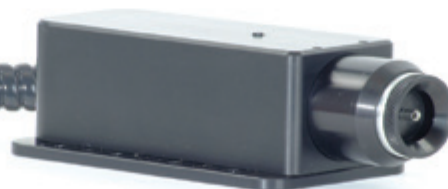
(FCL-B3000 and FCL-B4000 Series)

Various CleanBlast Adapters are available for most common connector types.