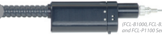
(FCL-B1000, FCL-B3000, and FCL-P1100 Series)