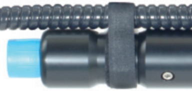
(FCL-B6000 and FCL-P6100 Series)